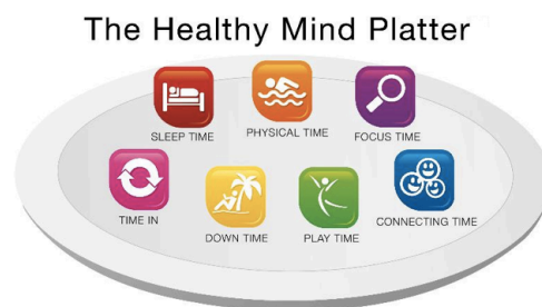
The Healthy Mind Platter, for Optimal Brain Matter